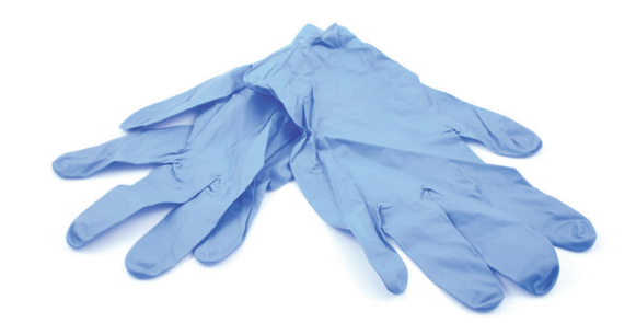
Representative image only. Colour of gloves can be different.

Like you, Katun has the well-being of your service engineers in mind. That's why our safety and personal care offering consists of high-quality, reputable products, including various sizes of durable latex gloves, hand sanitizers, and hand cleaners.