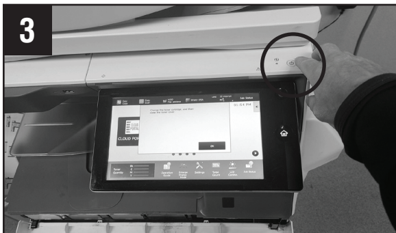
3. Power off the machine by pressing power button (located just above touchscreen in the upper right corner)