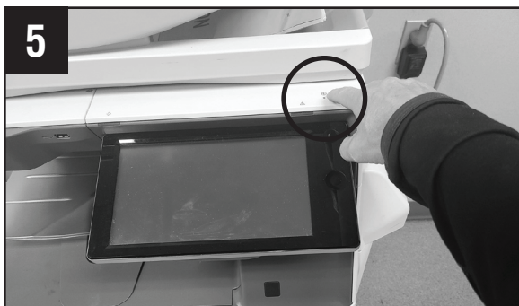
5. Power on the machine by pressing power button