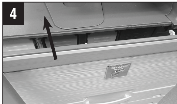
4. Close the toner cartridge access cover