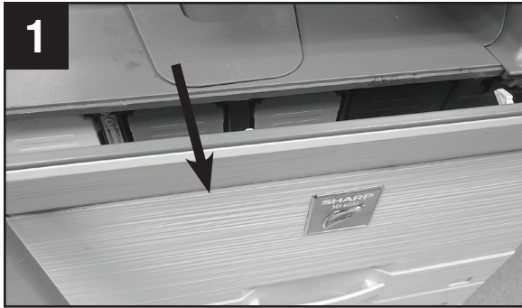
1. Open the toner cartridge access cover

Please follow these if machine ejects toner cartridges after toner cartridge access cover is closed.